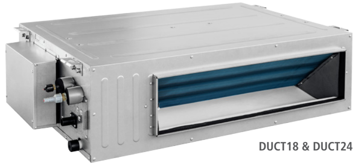
DUCT18 & DUCT24